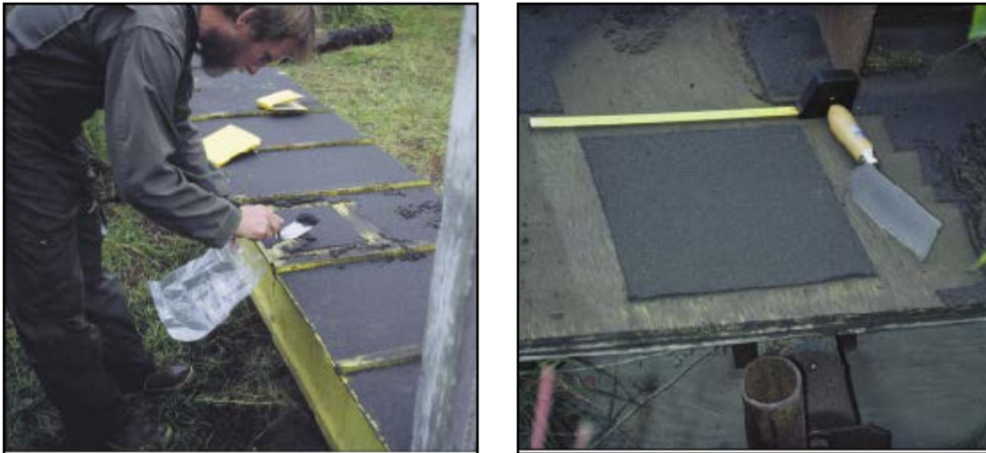
Figure 2. Collection of measured-area tephra samples from hard surfaces after 1992 eruption of Crater Peak/Mount Spurr, AK (photo from September 21, 1992).