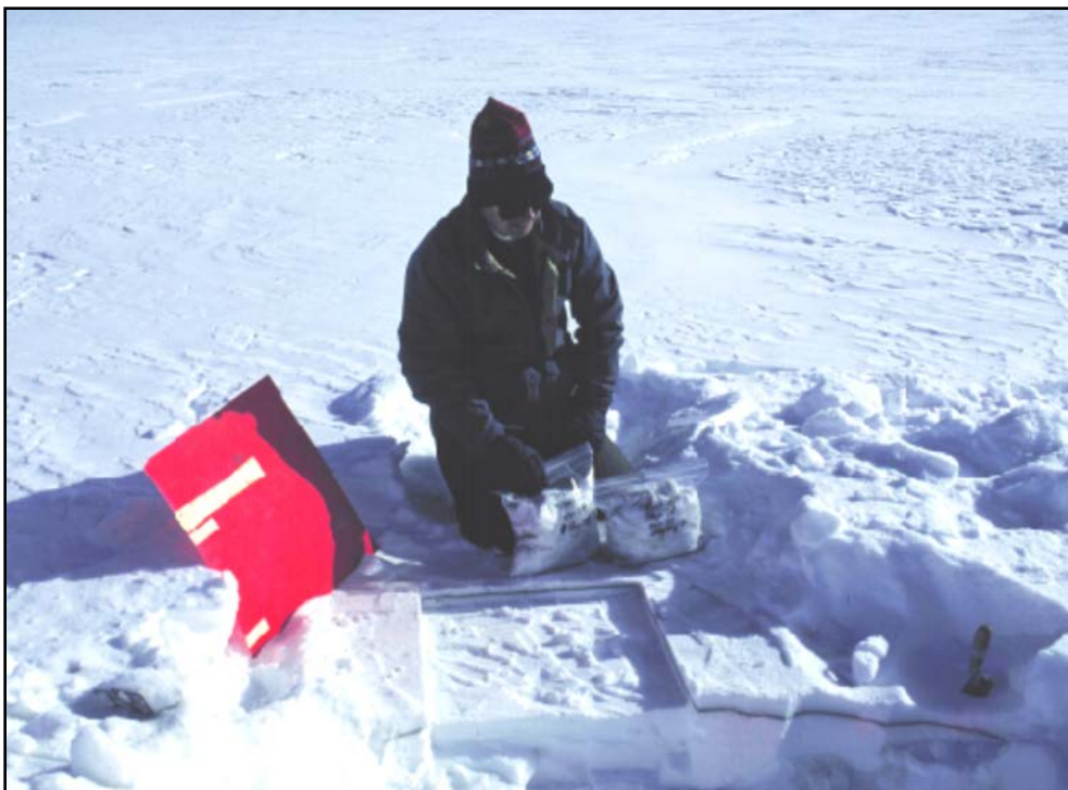
Figure 1. Collection of measured-area ash samples from snow pack after the 1992 eruption of Crater Peak/Mount Spurr, AK (photo taken on September 24, 1992).